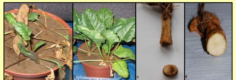
Figure 3: Sugar beet infested by F. oxysporum , (a) 10 weeks after inoculation with a US-isolate, (b) not inoculated control, (c) vascular discolouration caused by a French isolate, (d) not inoculated control

At beet harvest , phenotypical features of the plants were recorded. Infestation rate was determined by re-isolation of the causal Fusarium spec. Microscopical investigations (Calcufluor-White staining) recorded the degree of fungal systemic infections.