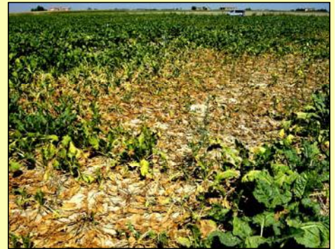
Figure 1: F. oxysporum infested sugar beet field in Italy

Our investigations aimed to determine to what extent sugar beet could serve as a host for colonisation with different Fusarium species ( F. culmorum and F. graminearum ) known to be pathogenic for cereals and to compare their potential with a species ( F. oxysporum from different geographical origin) known to be pathogenic in sugar beet as well as a species ( F. sambucinum ) characterized by a high saprophytic competence.