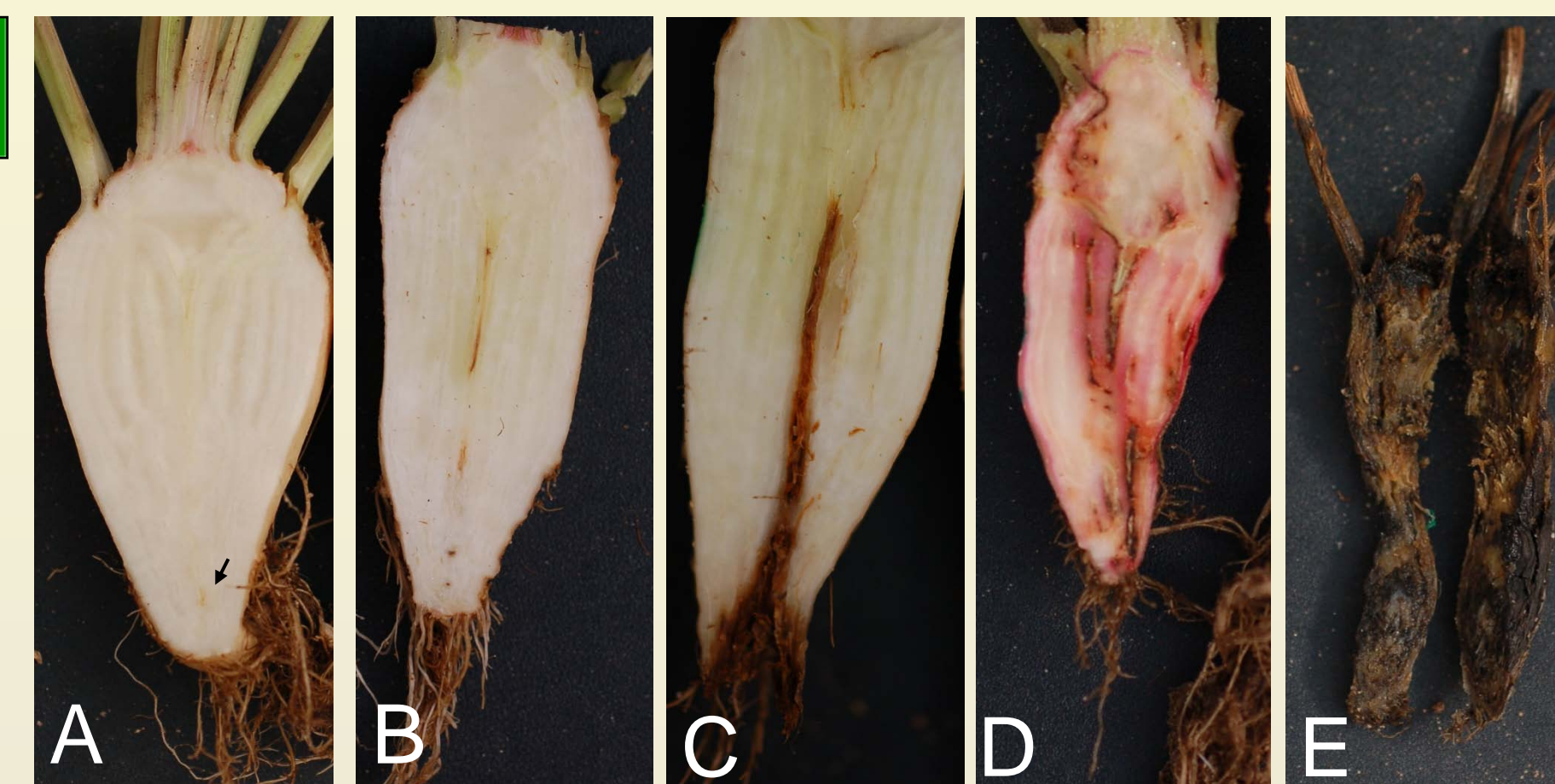
Figure 2: Symptoms in 16-week-old sugar beets after inoculation with Fusarium spp.

Freshly-harvested beets were obviously healthy-looking, however, from an average of 12% in 2006 and 9% in 2007, Fusarium spp. were isolated. Pathogenicity tests in the greenhouse revealed that only F. graminearum and F. sambucinum caused more severe root symptoms (Figure 2, C–E). Beets inoculated with other species like F. redolens , F. tricinctum , and F. culmorum , displayed rather mild symptoms (Figure 2, A–B). However, the latter as well as F. cerealis caused severe secondary root rot when beets were mechanically injured (data not shown). Results suggest that most isolates detected in sugar beet are endophytic or saprotrophic colonisers.