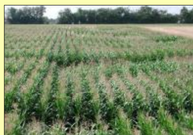
Fig. 2: Field site in 2003