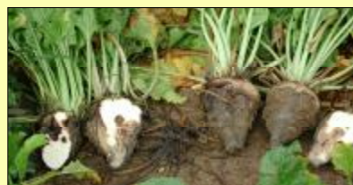
Fig. 1: Root and crown rot of sugar beet

Rhizoctonia solani Kühn is a heterogeneous fungal species group that is distributed worldwide. Its anastomosis groups (AG) are pathogenic to a wide range of plants. R. solani AG 2-IIIB infects both sugar beet (Fig. 1) and maize, which are cultivated in the same rotation. The cultivation of R. solani resistant maize genotypes in rotation with resistant sugar beet might be an important integrated measure for disease control. We hypothesised that disease severity in susceptible sugar beet grown after maize as pre-crop is related to the susceptibility of the maize genotype.